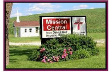
40718 Highway E-16 Mapleton, Iowa 51034 Website www.missioncentral.us

Dear NOT NORMAL Co-workers for the Lord Jesus: