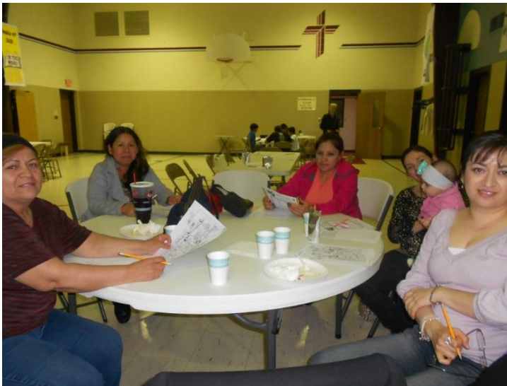
Hope English class in South Sioux City, NE on the closing night for the spring session, May 2015.