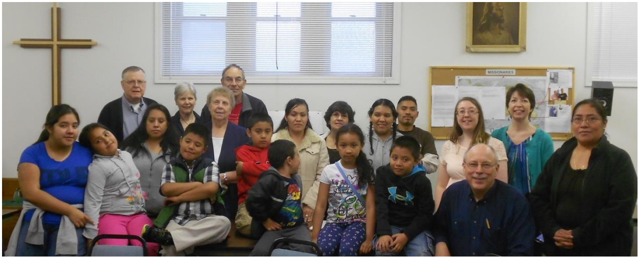
St. Paul's English class on closing night with some of the students, family, and teachers.