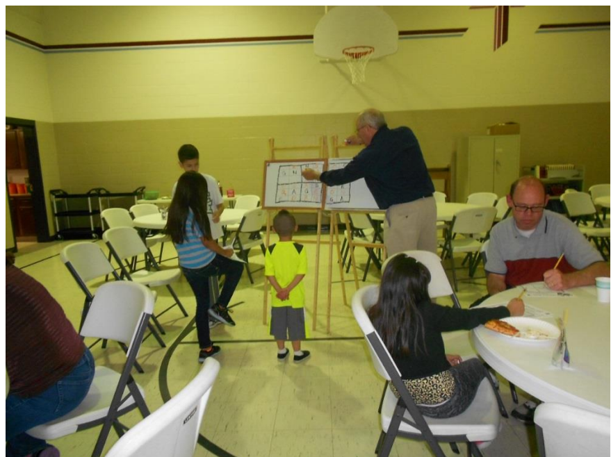
Students and teachers at the Hope English class work on some word games based on a Bible verse and the story of Jesus healing the paralytic.