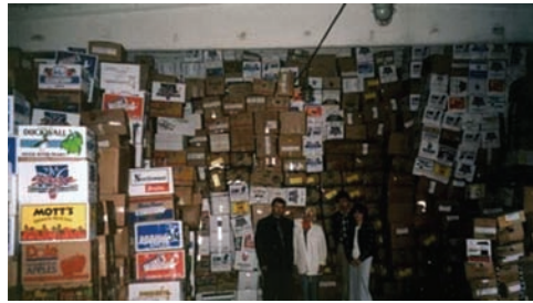
Boxes of Orphan Grain Train humanitarian aid at the Red Cross warehouse in Riga.

of school supplies. Thanks to your gifts, many children now have warmth and hope.