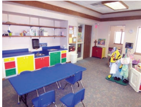
One of the new classrooms provides a bright learning environment for Sunday School and Our Savior Open Arms Preschool.

(or more) it appears "too full" for visitors and it seems to create a glass ceiling on attendance. If visitors have to be split up between pews and not able to worship as a family, they probably feel less comfortable. While comfort is obviously not the main focus of our worship, avoiding discomfort for our guests IS a consideration. Though it was a tough decision since the entire church "family" would not be able to worship all at once, Our Savior added a Saturday evening worship service a couple years ago.