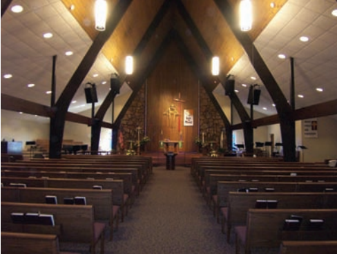
The dark beams above display the original dimensions of the sanctuary before Our Savior's recent expansion.

And these members are out touching the world. Our Savior supports eight missionaries serving areas such as Los Angeles, Nigeria, Kyrgyzstan, Taiwan and Korea. Not only do they host a number of visiting missionaries, members are also active serving on short-term mission trips themselves at home and around the world.