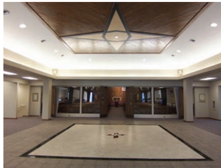
Our Savior Lutheran Church in Denison celebrated Dedication Sunday on September 13, 2009. Included in the construction is a new, spacious narthex.