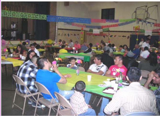
The gym at Zion School was full for the afternoon.