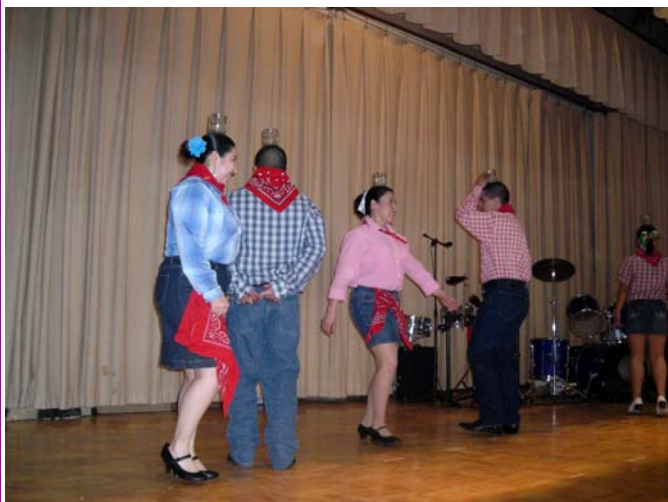
One of many folk dances from Mexico & Central America.