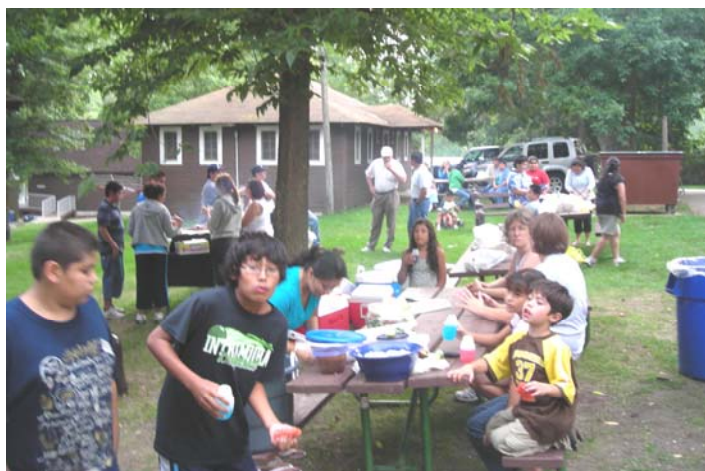
Our Saturday evening BBQ was a beautiful gathering of food, fellowship, and music.